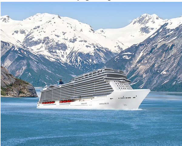
An Alaskan Voyage (August 2019)

**For questions or brochures on our travel programs, please stop by our front desk.**