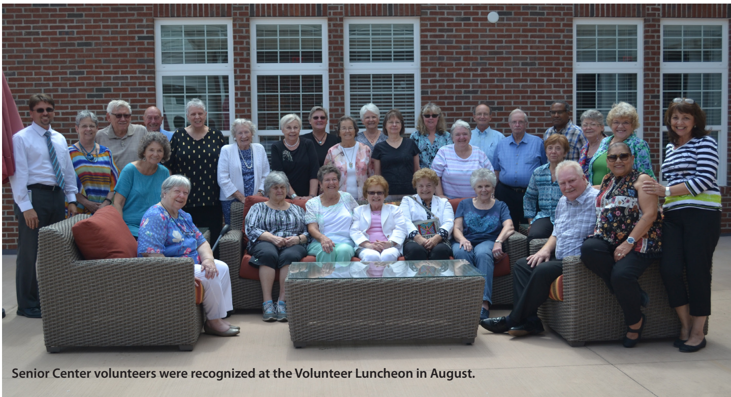
Senior Center volunteers were recognized at the Volunteer Luncheon in August.