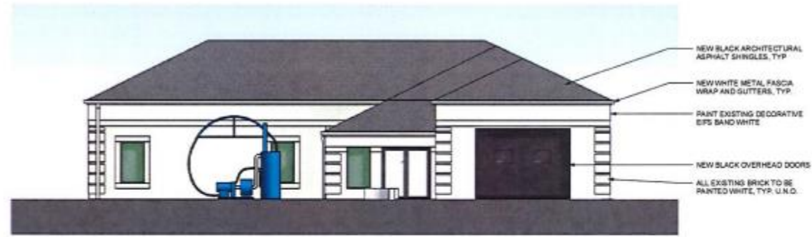
NORTH ELEVATION 3/16" = 1'-0"