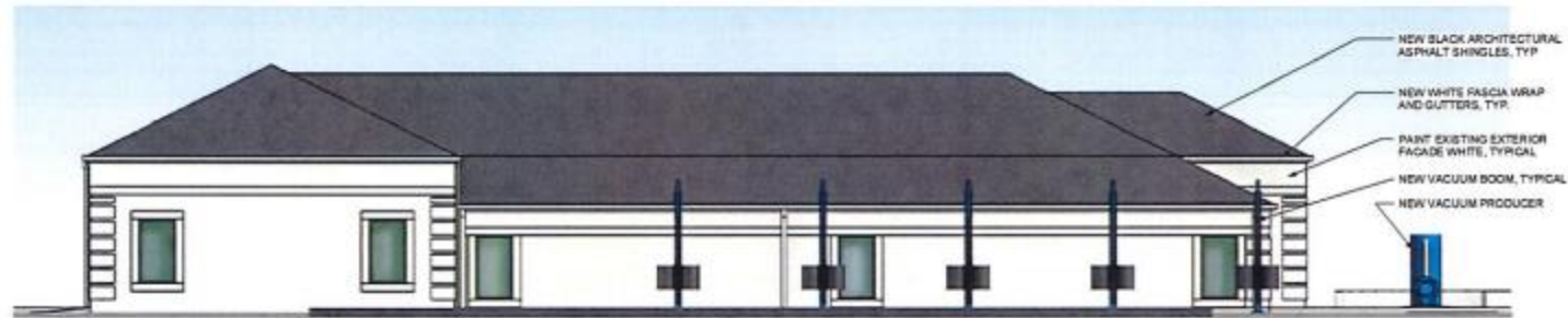
EAST ELEVATION 3/16" = 1'-0"