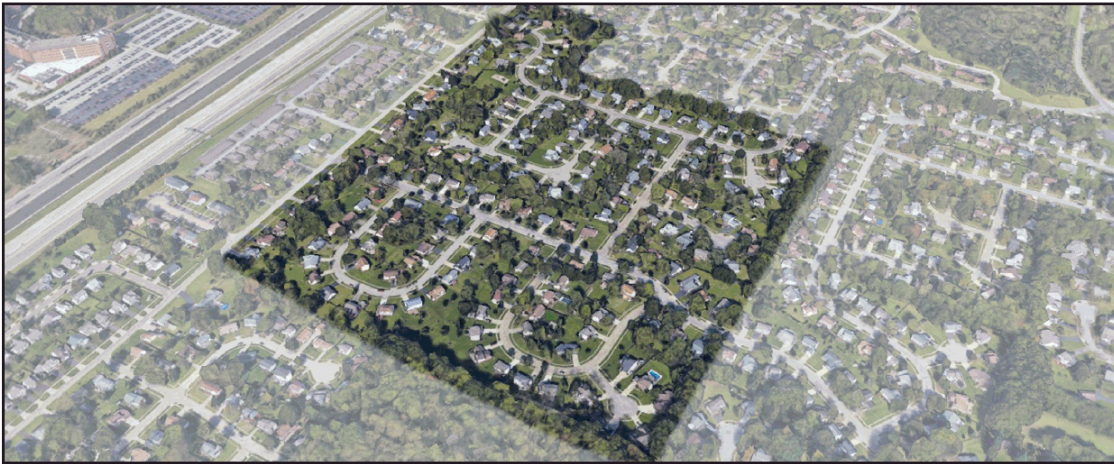
Figure 19: Small Lot Residential includes several distinct geographic areas and may include the area depicted in the image above. For the official zoning map, please visit the City of Gahanna's website.