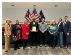
Black History Month