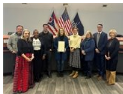
Cervical Health Awareness Month