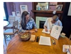
Self-Care Open House