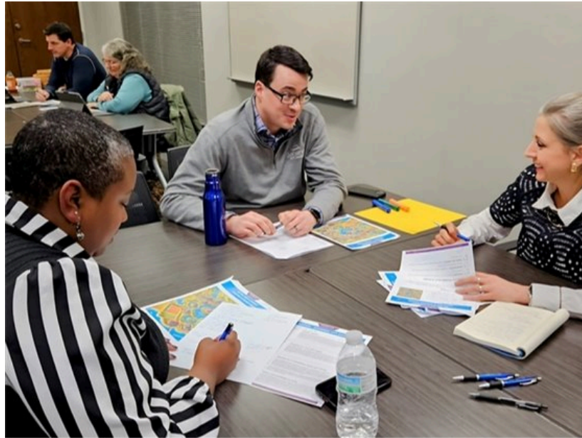
City Council Workshop - January 27, 2025