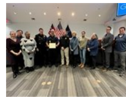
School Resource Officers Day