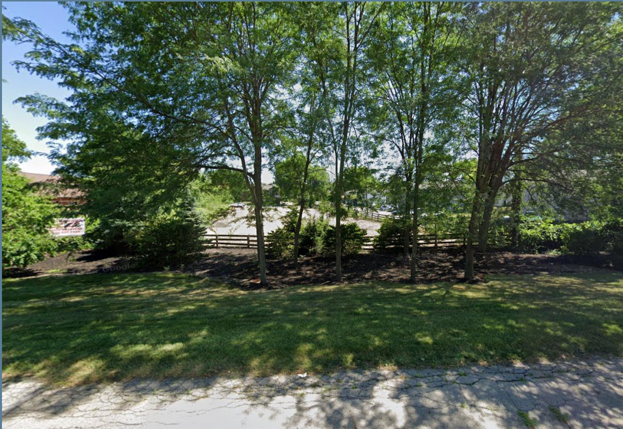
View from US-62