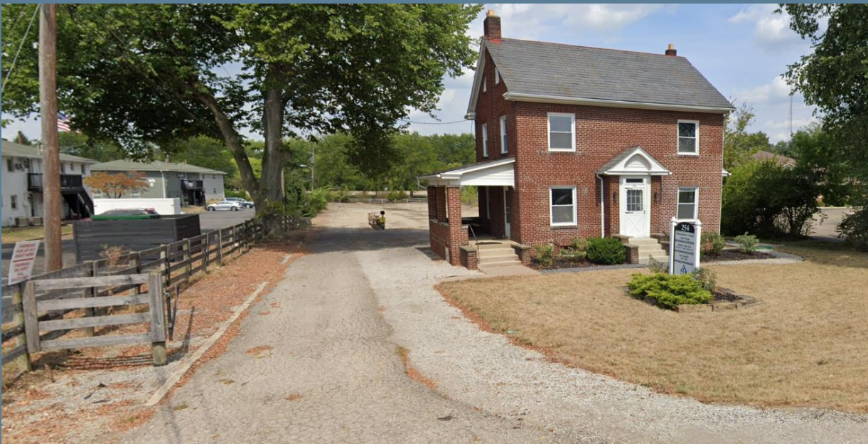
View from Johnstown Rd