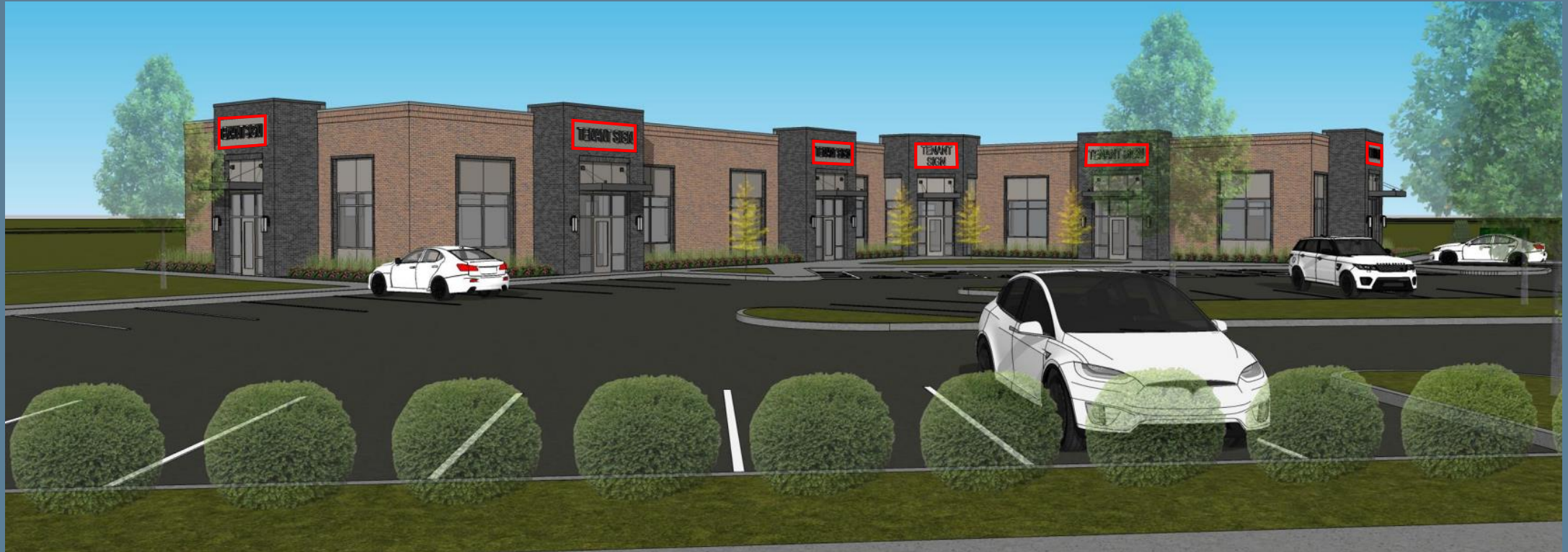
View from Crescent Cir