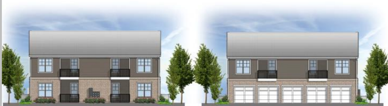
Building A Side Elev 1 1/8" = 1'-0"