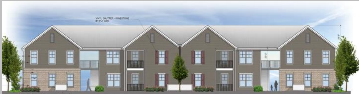
Building A Front Elevation 1/8" = 1'-0"