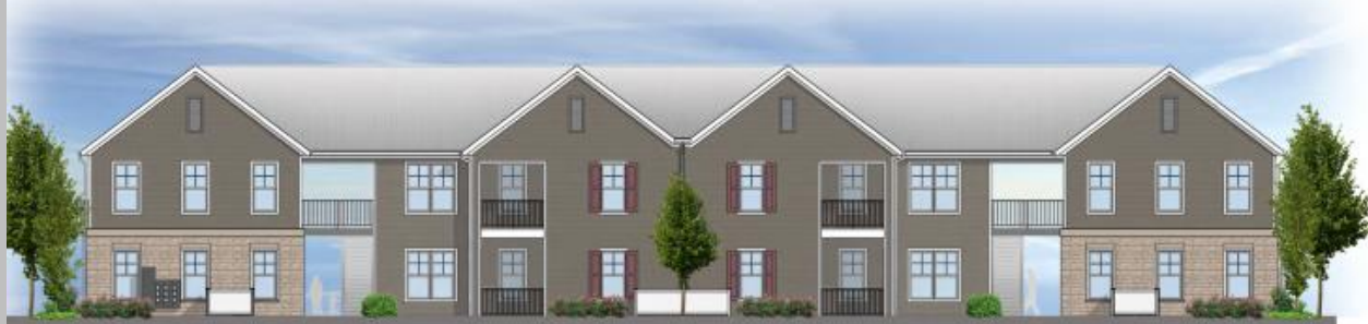
Building A Rear Elevation 1/8" = 1'-0"