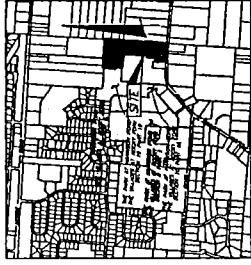
LOCATION MAP AND BACKGROUND DRAWING SCALE 1"=100'