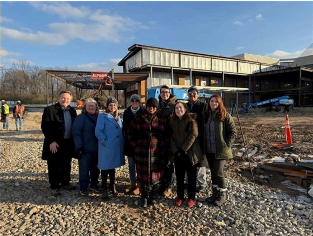
Council Members and staff participate in the City Top Out ceremony at the site of the future Gahanna Municipal Complex - December 3, 2024.