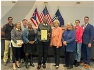
Small Business Saturday Resolution

For complete agendas and legislative details and to sign up for agendas delivered to your inbox,, visit our official portal on Legistar [ https://gahanna.legistar.com/Calendar.aspx ].