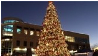
Holiday Lights Celebration

Stay Connected with Your City Council and stay informed about the decisions shaping Gahanna’s future!