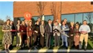
Orthopedic ONE Grand Opening