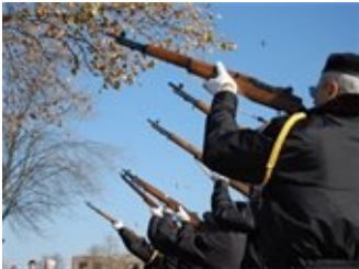
Veterans' Day Ceremony