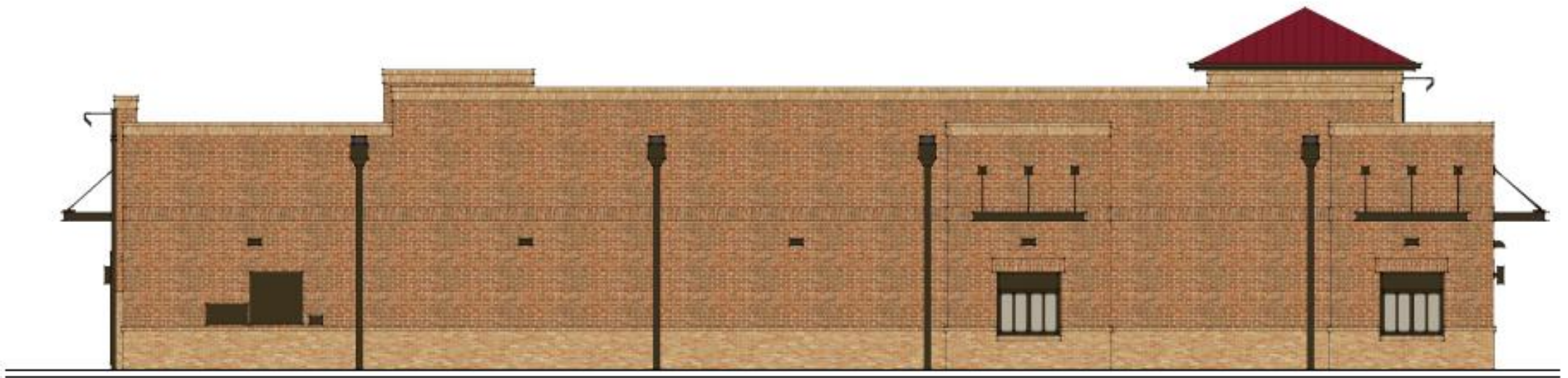
① EAST ELEVATION SCALE 1/4" = 1'-0"