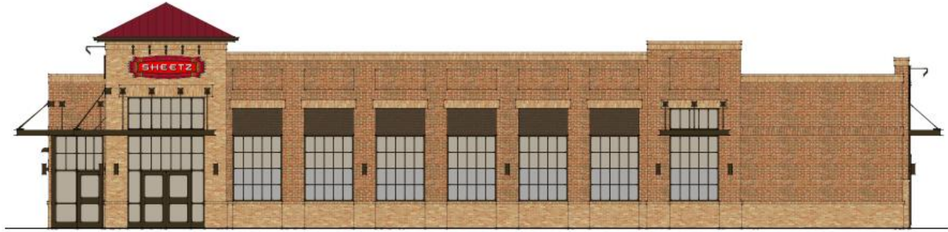
① WEST ELEVATION SCALE 1/4" = 1'-0"