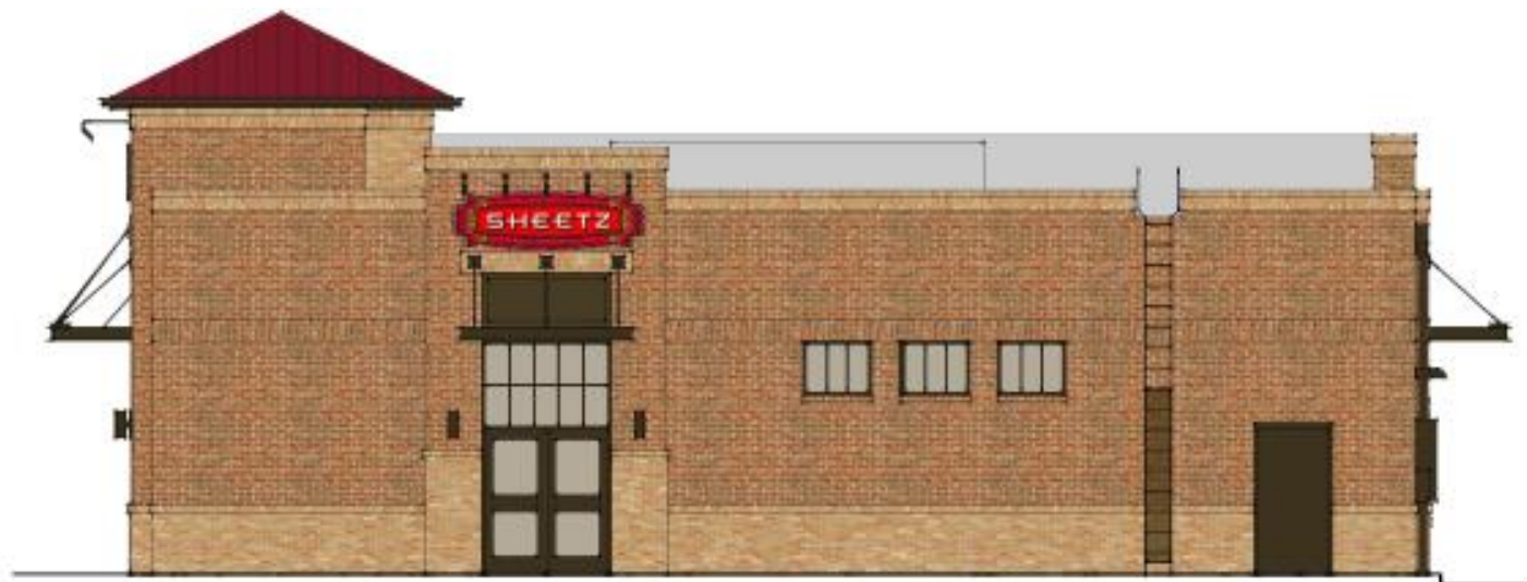
② SOUTH ELEVATION SCALE 1/4" = 1'-0"