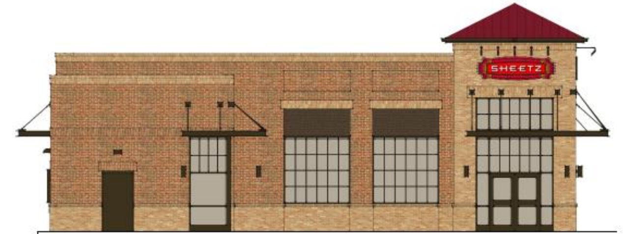
② NORTH ELEVATION SCALE 1/4" = 1'-0"