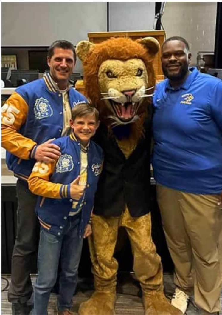
Gahanna Football League awards banquet