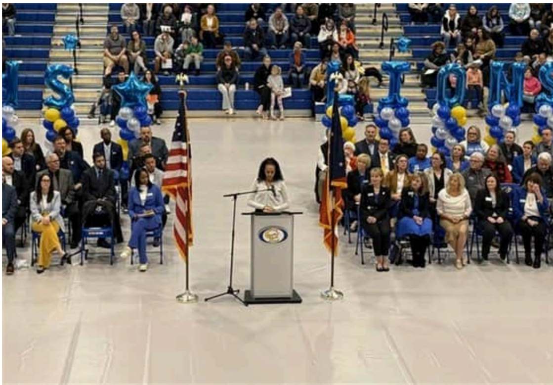
Gahanna Lincoln High School Open House