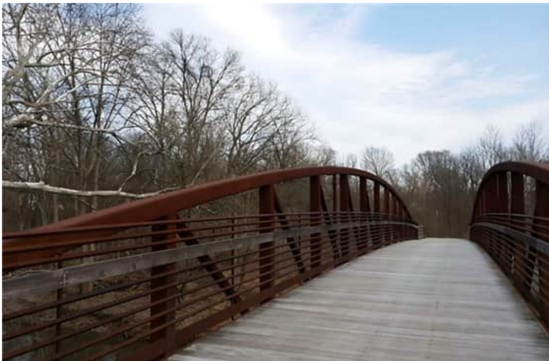
Big Walnut Trail Bridge