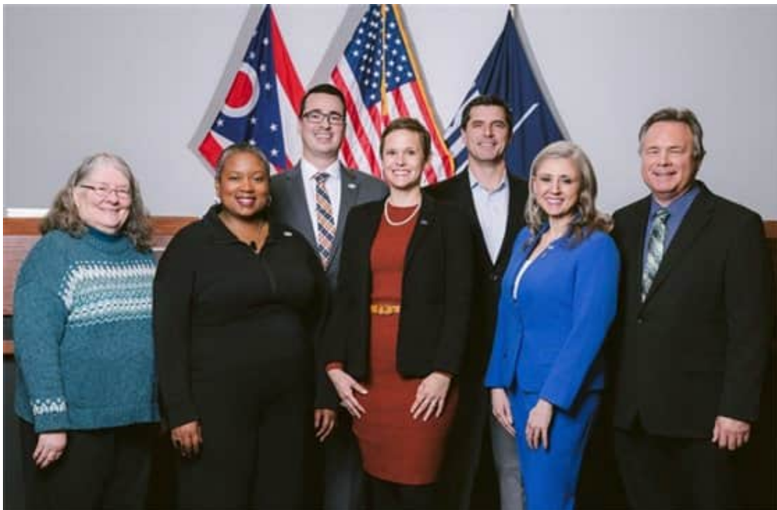
Gahanna City Council