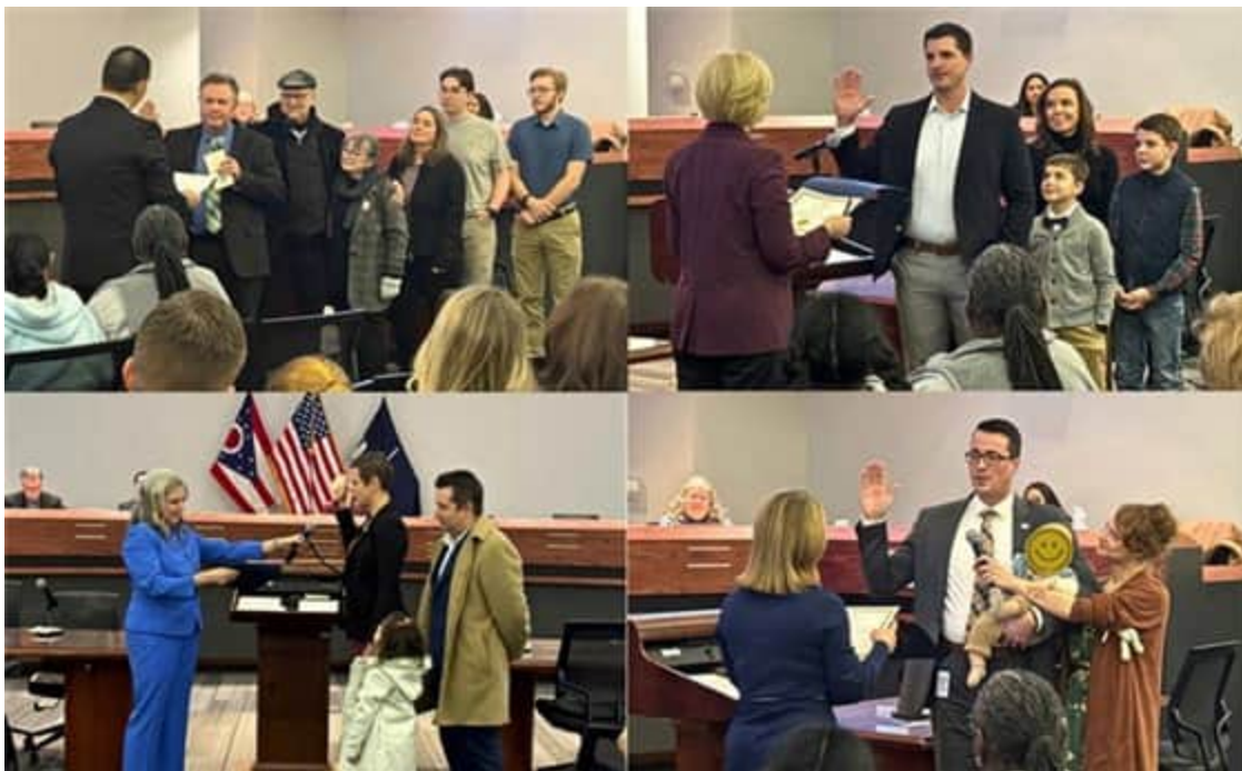
Ward Representatives are sworn into office following a successful re-election.