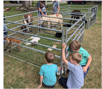
Enjoying farm animals at Pioneer Day!