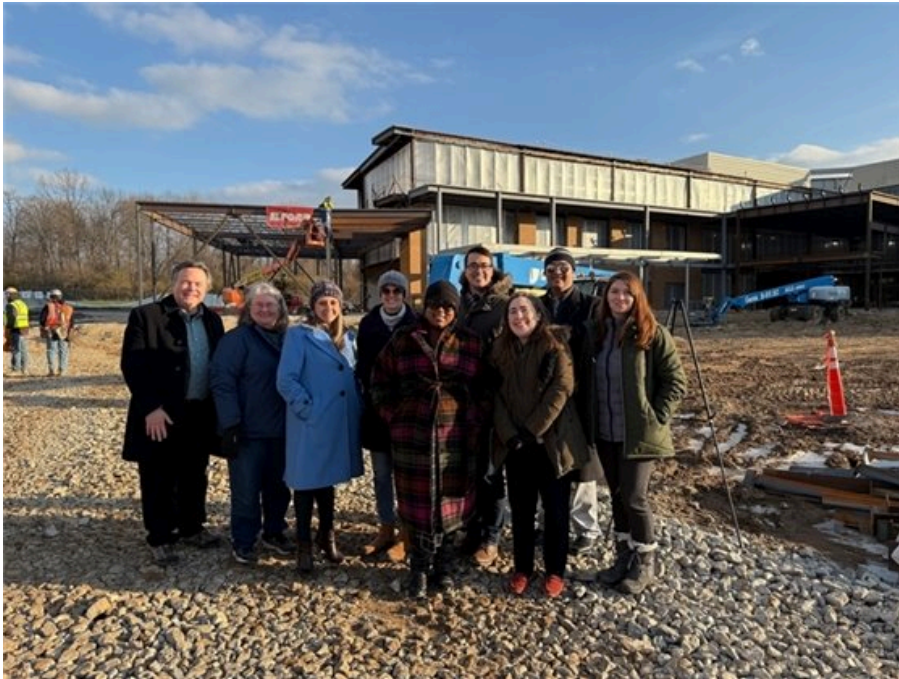
Council Members and staff participate in the City Top Out ceremony at the site of the future Gahanna Municipal Complex - December 3, 2024.