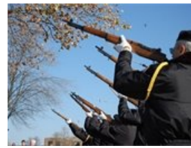
Veterans Day Ceremony