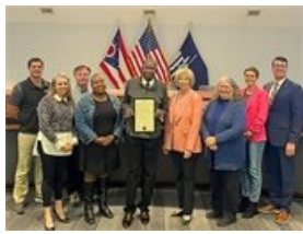
Small Business Saturday Resolution