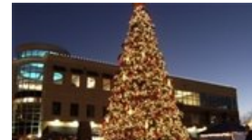
Holiday Lights Celebration