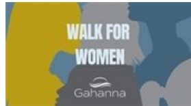
Walk for Women

Thank you to all Councilmembers, partners, and volunteers for their continued dedication to making Gahanna a thriving and inclusive community!