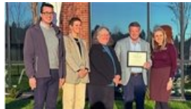
Orthopedic ONE Grand Opening