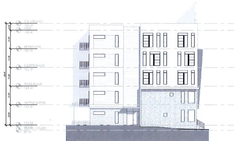
3 BLDG 1 - NORTH SCALE 1/16" = 1'-0"