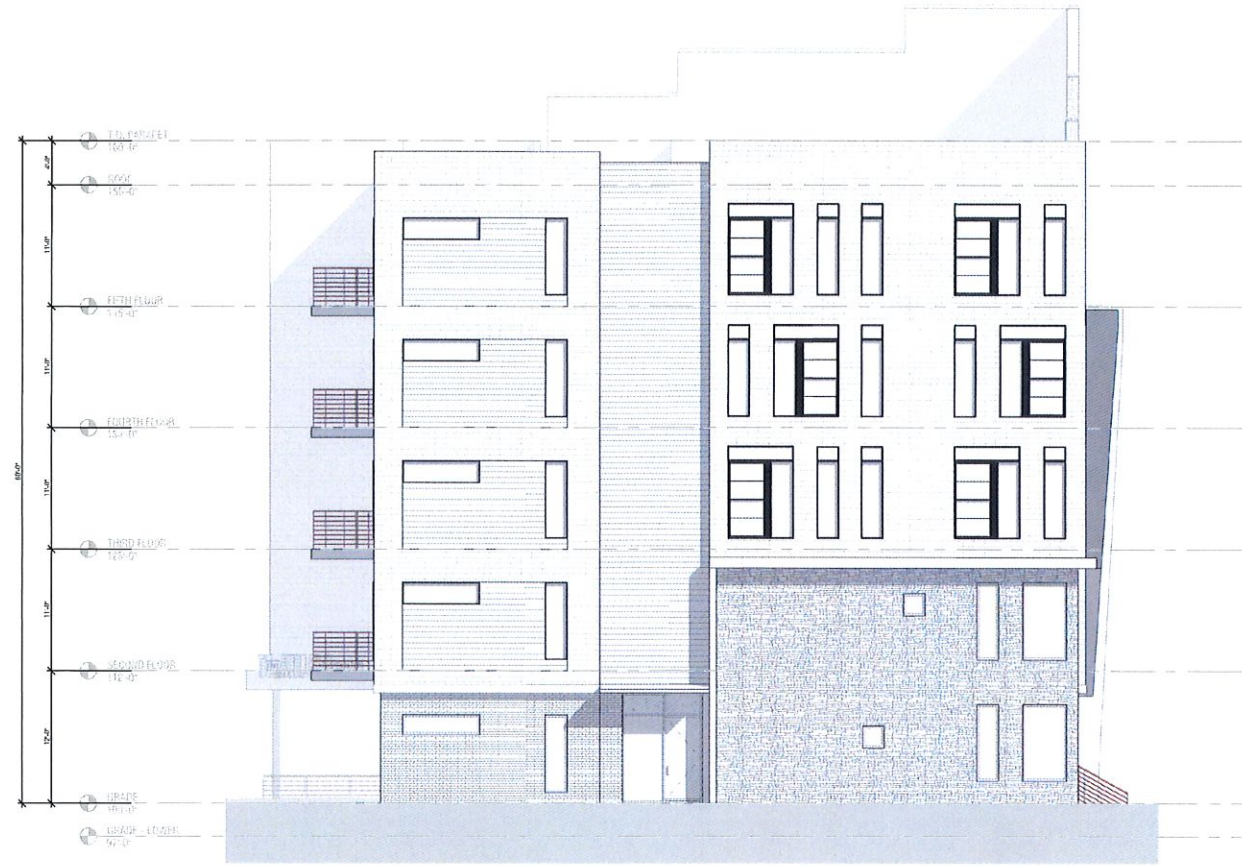
1 BLDG 1 - NORTH Copy 1 SCALE 1/8" = 1'-0"