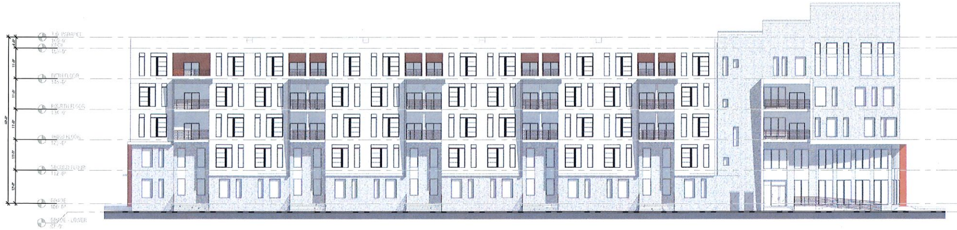
1 BLDG 1 - WEST SCALE 1/16" = 1'-0"