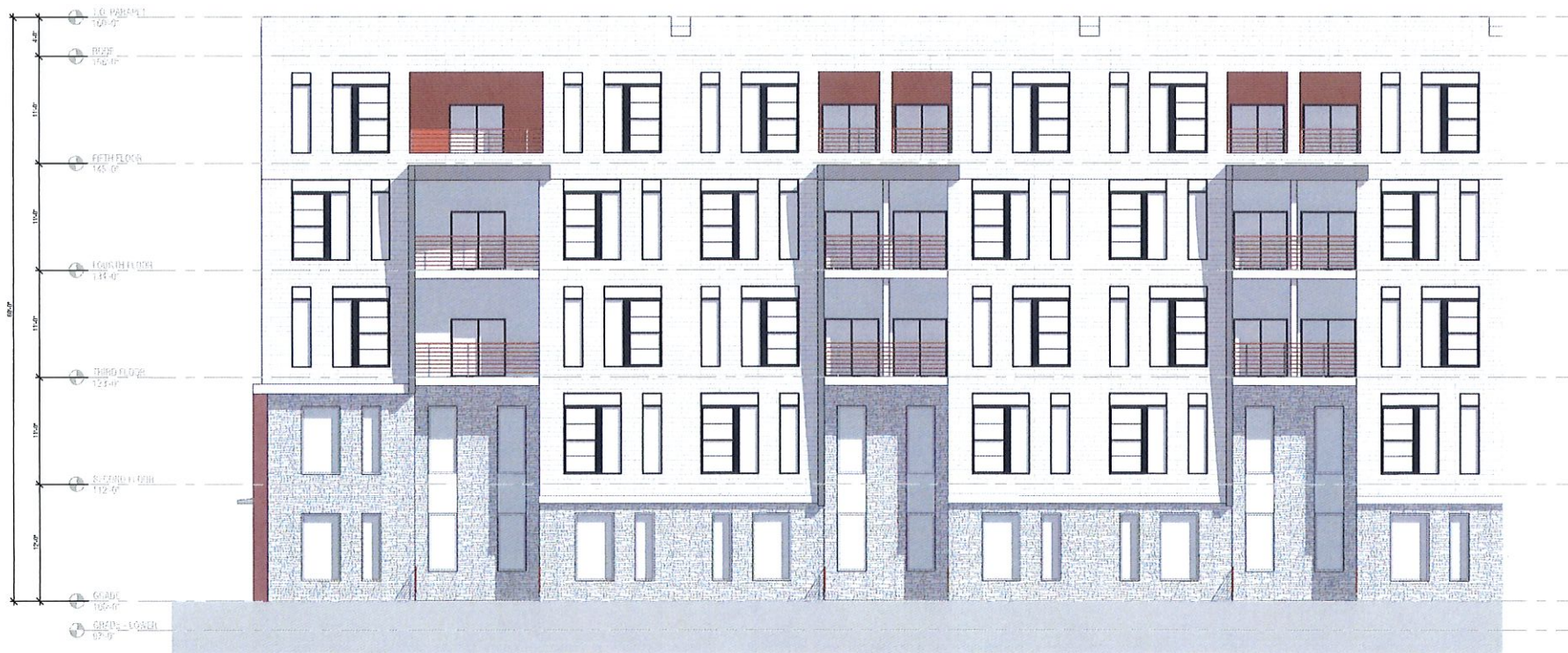
2 BLDG 1 - WEST B SCALE 1/8" = 1'-0"