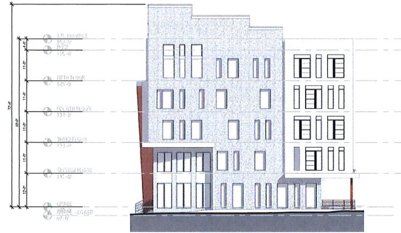
4 BLDG 1 - SOUTH SCALE 1/16" = 1'-0"