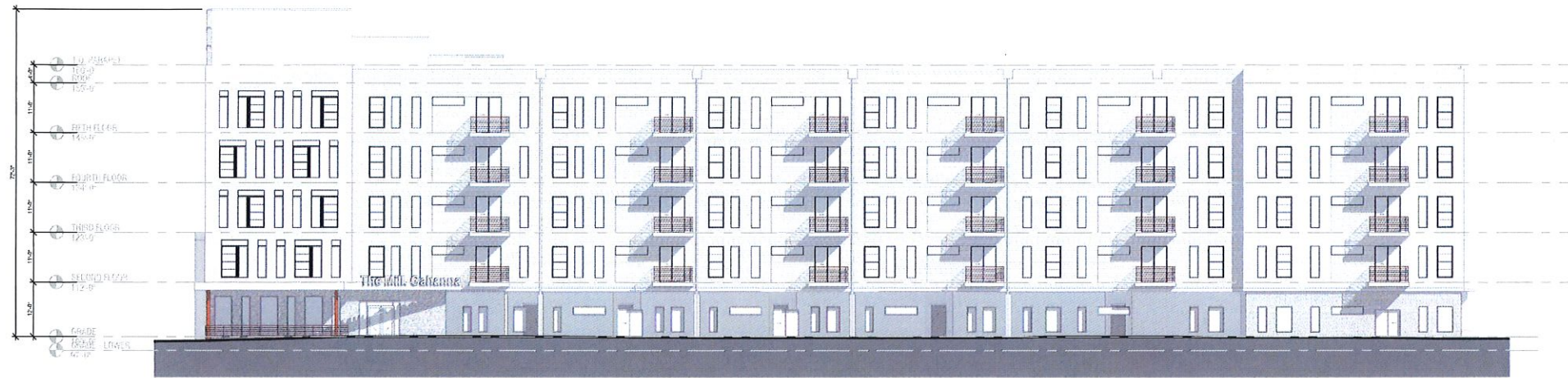
2 BLDG 1 - EAST SCALE 1/16" = 1'-0"