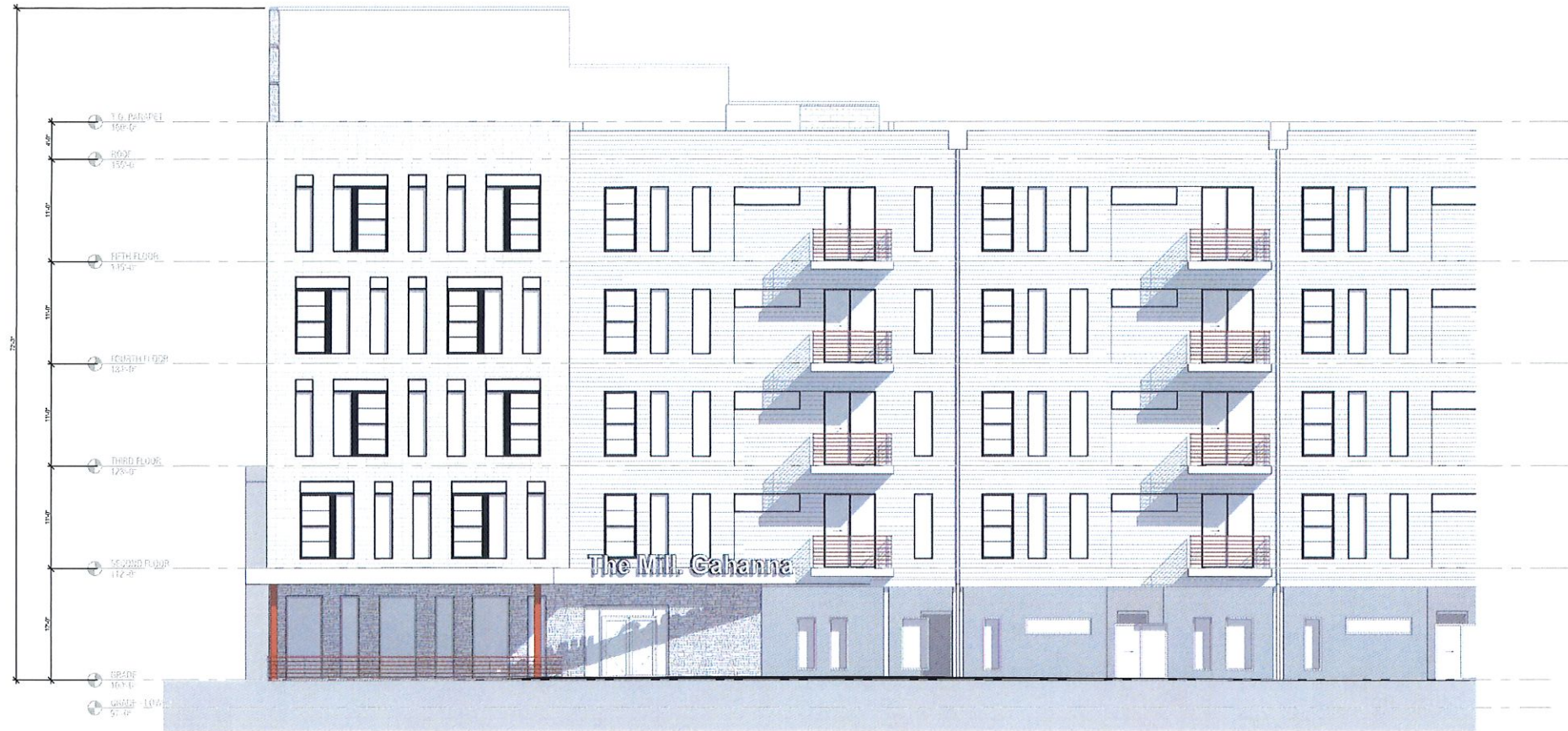
1 BLDG 1 - EAST A SCALE 1/8" = 1'-0"