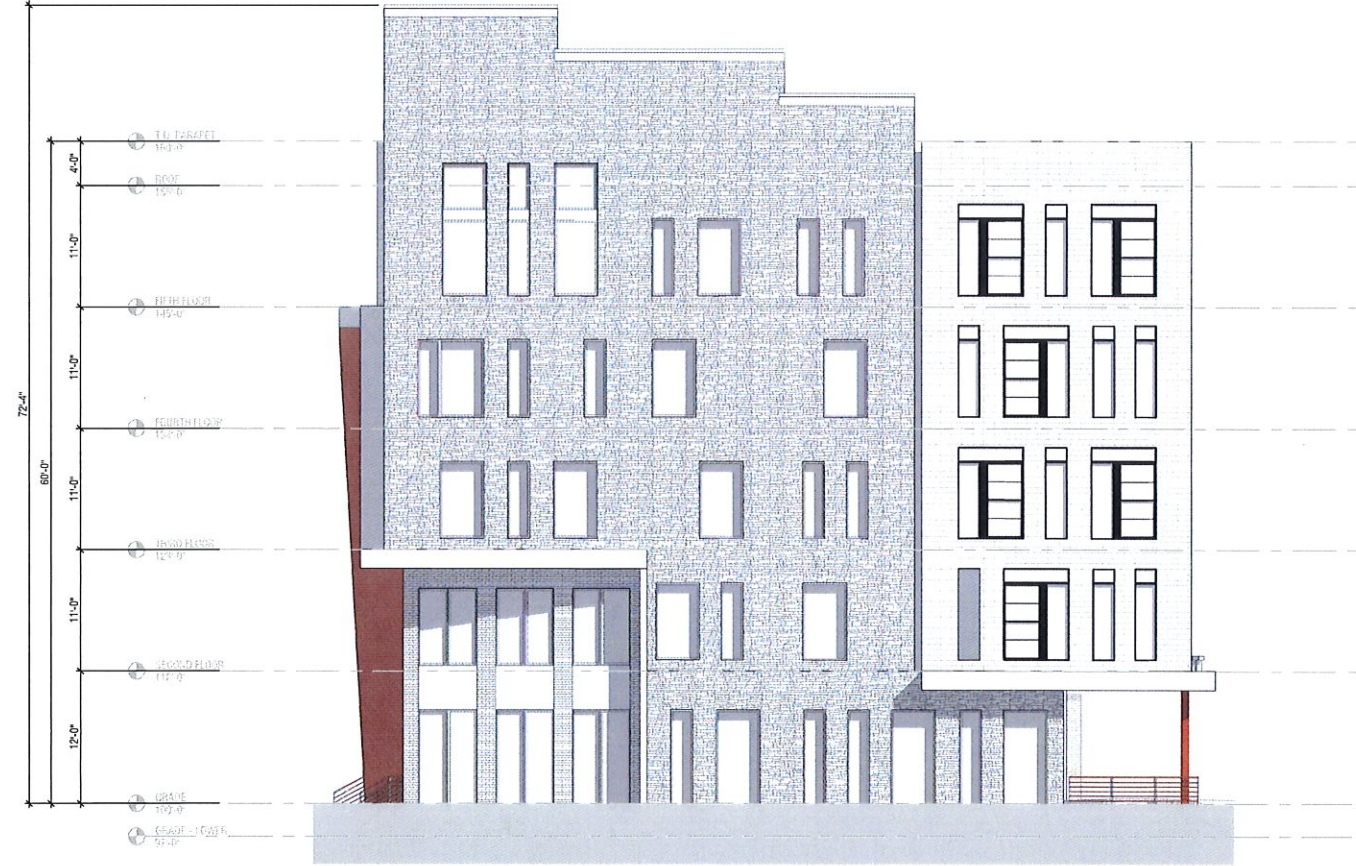
2 BLDG 1 - SOUTH Copy 1 SCALE 1/8" = 1'-0"