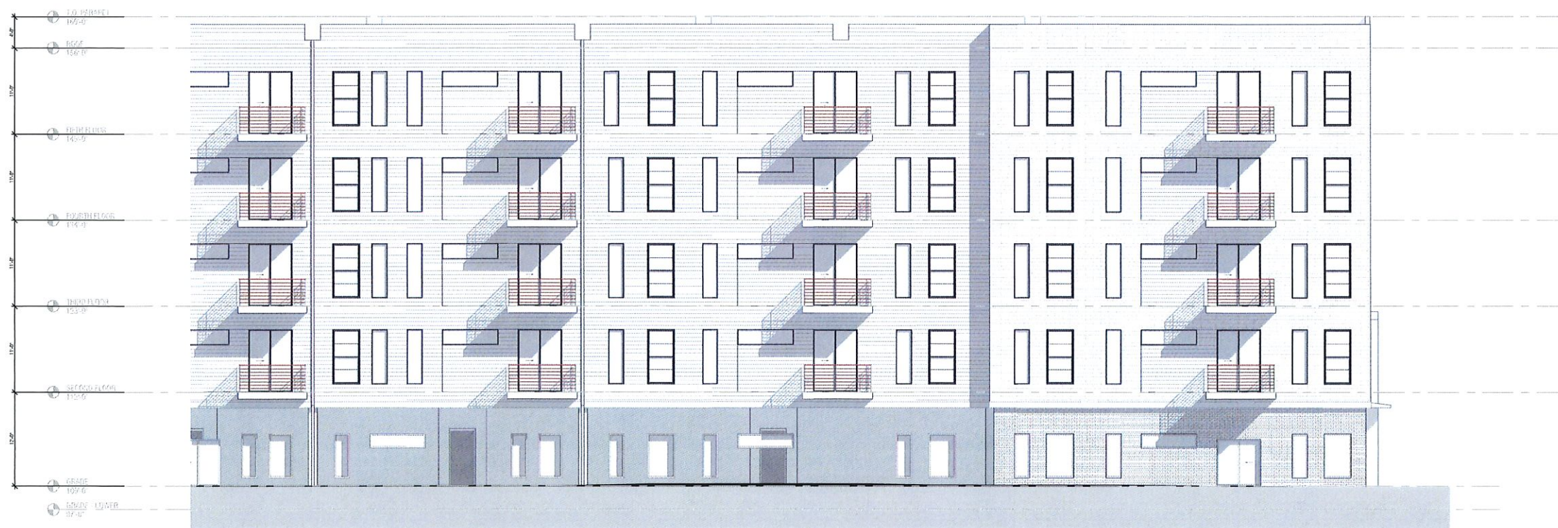
2 BLDG 1 - EAST B SCALE 1/8" = 1'-0"