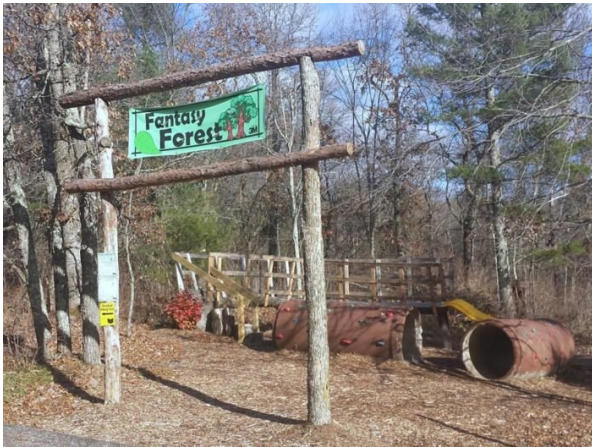
Entry way arch & donor kiosk