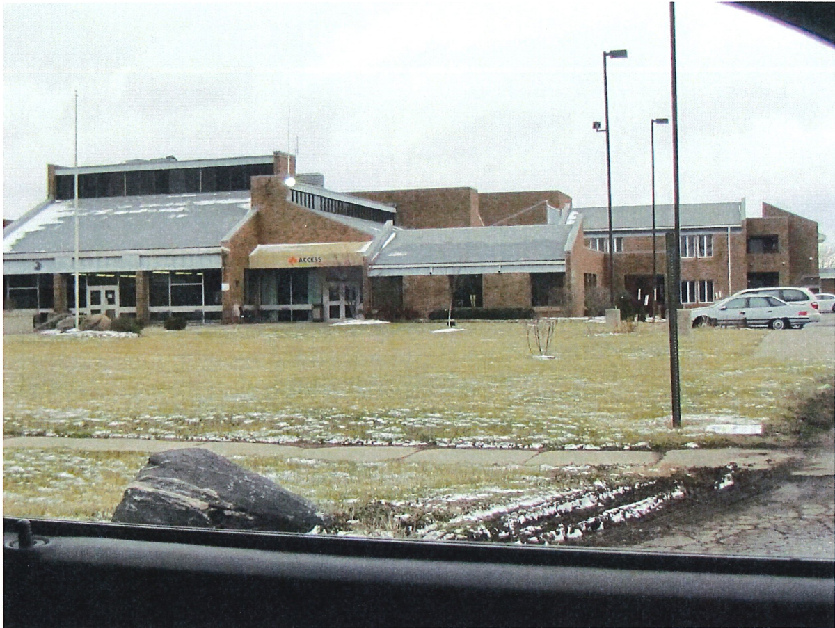
Entrance area at rear of facility.