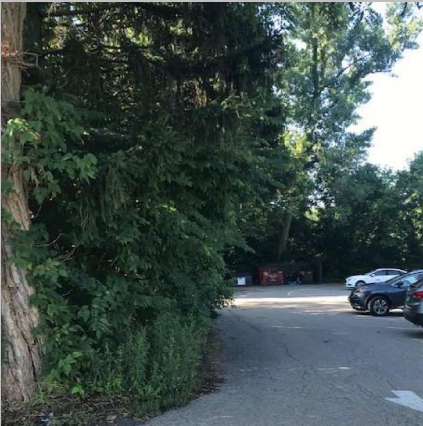
View of alley and adjacent property's front yard