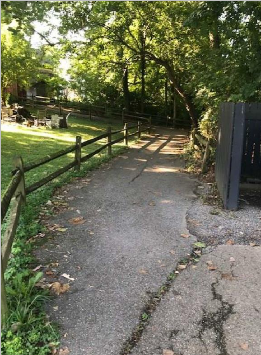
View of path on adjacent property/alley