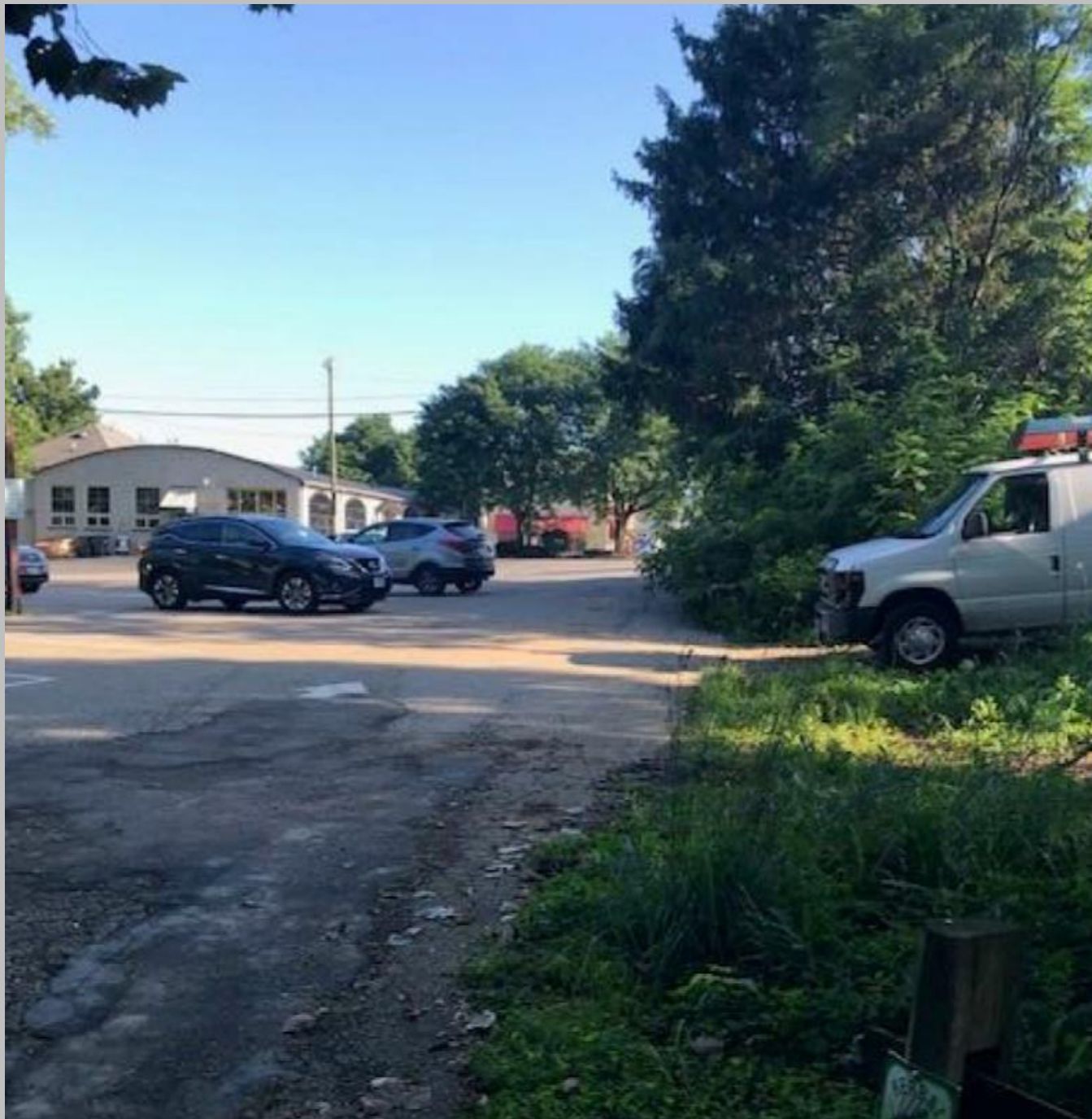
Alley view of subject property's front yard