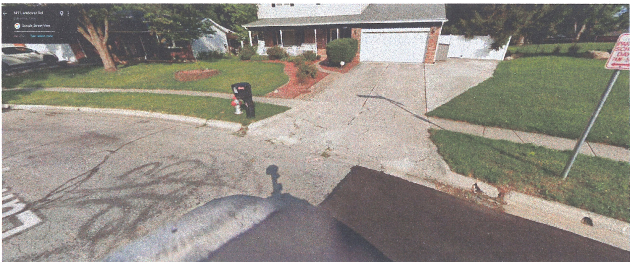
Exhibit B: Where the pavement starts/stops and where our curbs were not fixed.

We responded to this email, indicating that our property did not receive any repairs in 2021 or 2023 and indicated that you can see where the new pavement stopped, which is partially in front of our property. However, we received no repairs to any of our curbs at that time. Please see exhibit B: where the pavement starts/stops in front of our property and where our curbs were not fixed like everyone else's on Fleetrun Ave, who was part of the program.