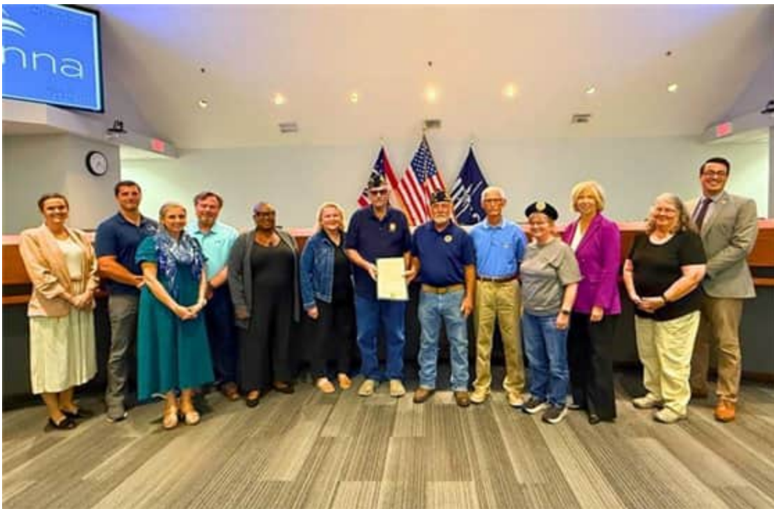
Honoring the Vietnam Traveling Memorial Wall: View RES-0042-2025