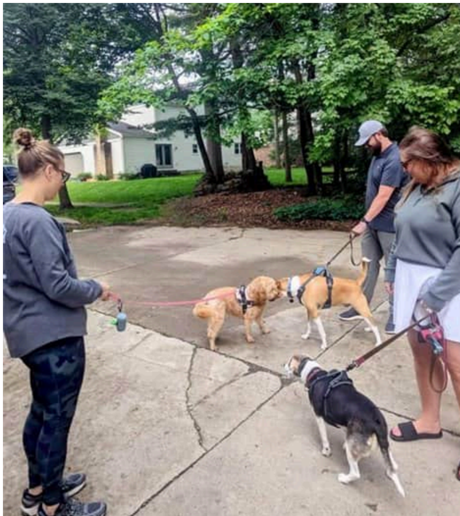
Scenes from a recent Council Constituent Hours event

We would love to hear from you! Stay engaged by reaching out to your Councilmembers, attending meetings, or joining a community event. Contact information for Councilmembers is included below.