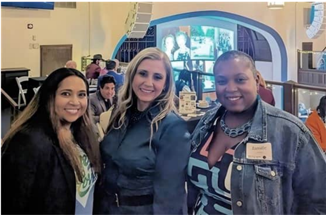
Councilmembers & City Attorney attended Equality Ohio's Advocates & Allies 2025 event.