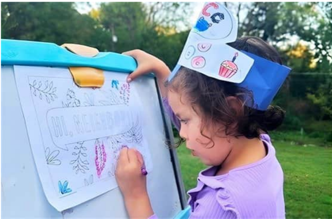
Good Neighbor Day 2025.