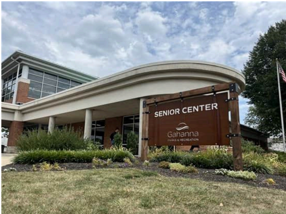
RES-0045-2025: Improved transportation for the Gahanna Senior Center