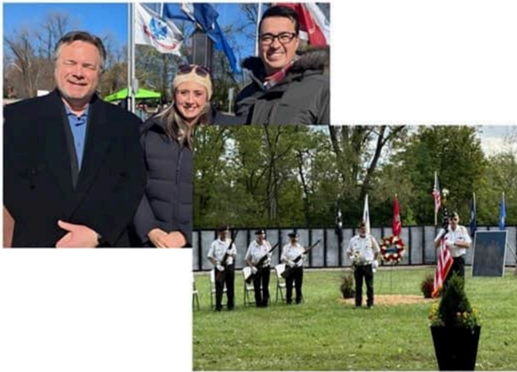
Vietnam Traveling Memorial Wall at the Veterans Memorial Park in Gahanna.