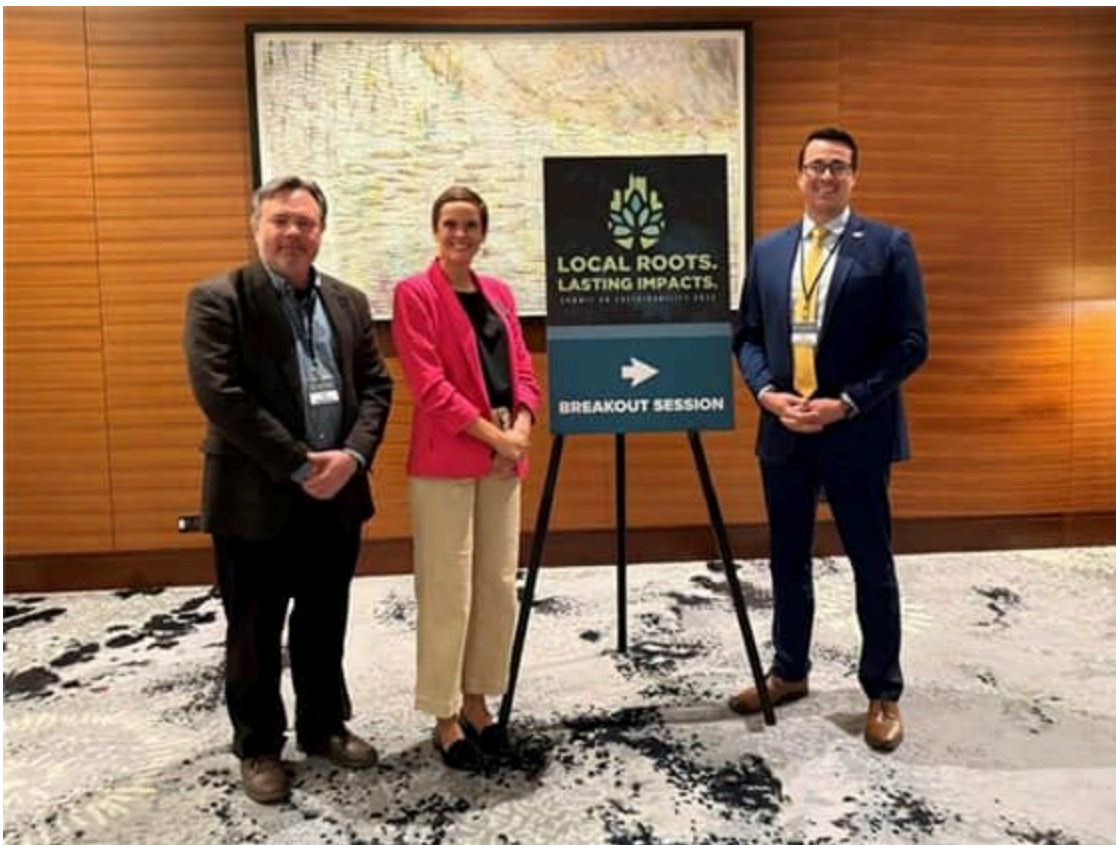
Councilmembers attended MORPC's annual Summit on Sustainability .