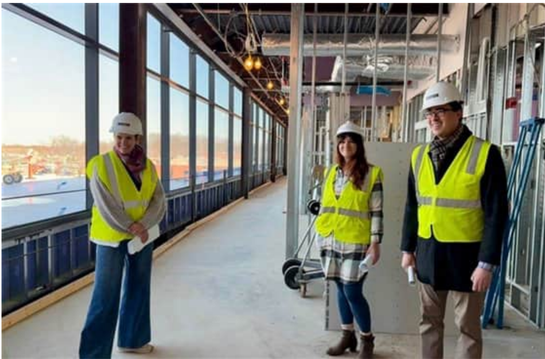
Members of the Council Office visiting the construction site of the city's new civic center.