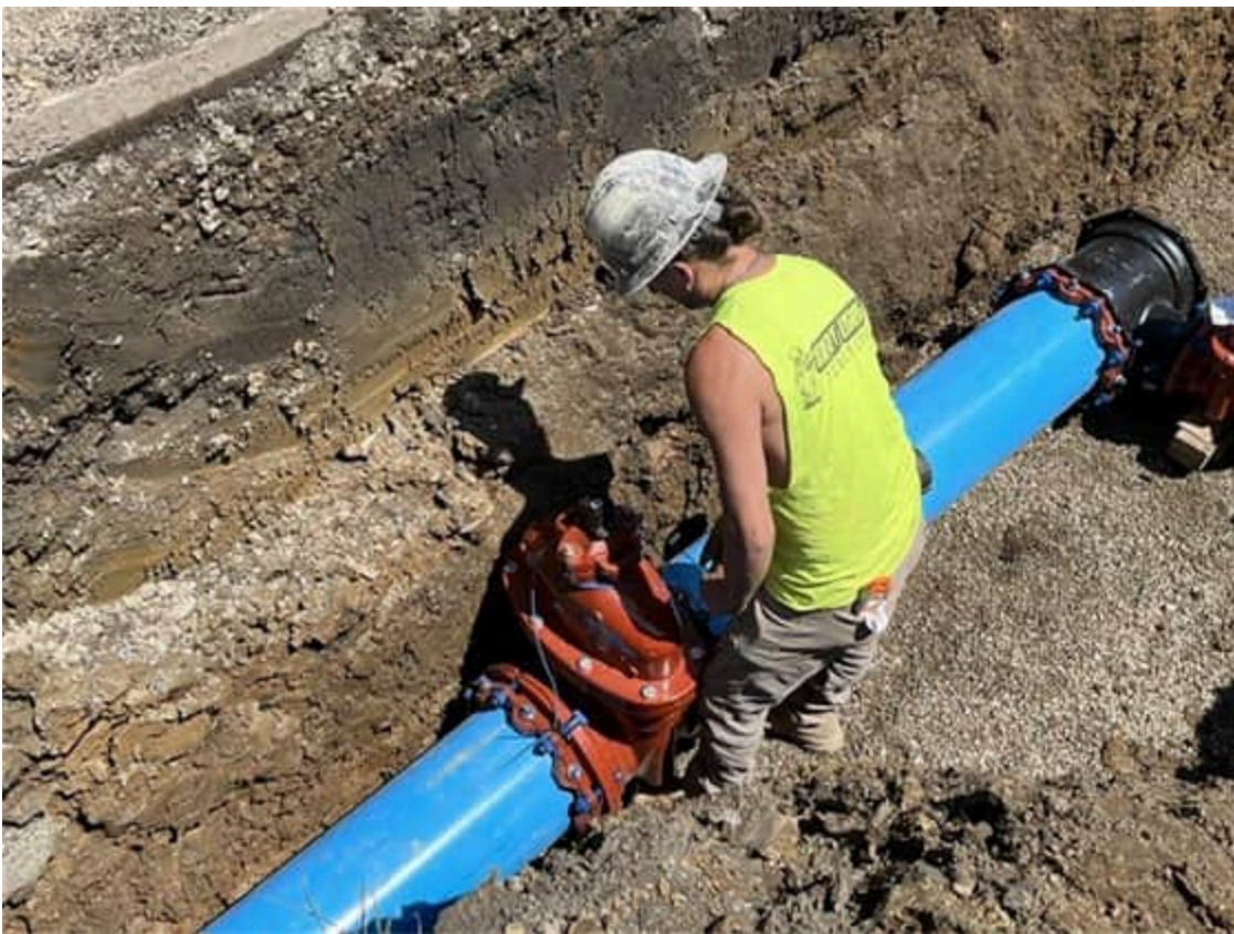
Waterline replacement 2024