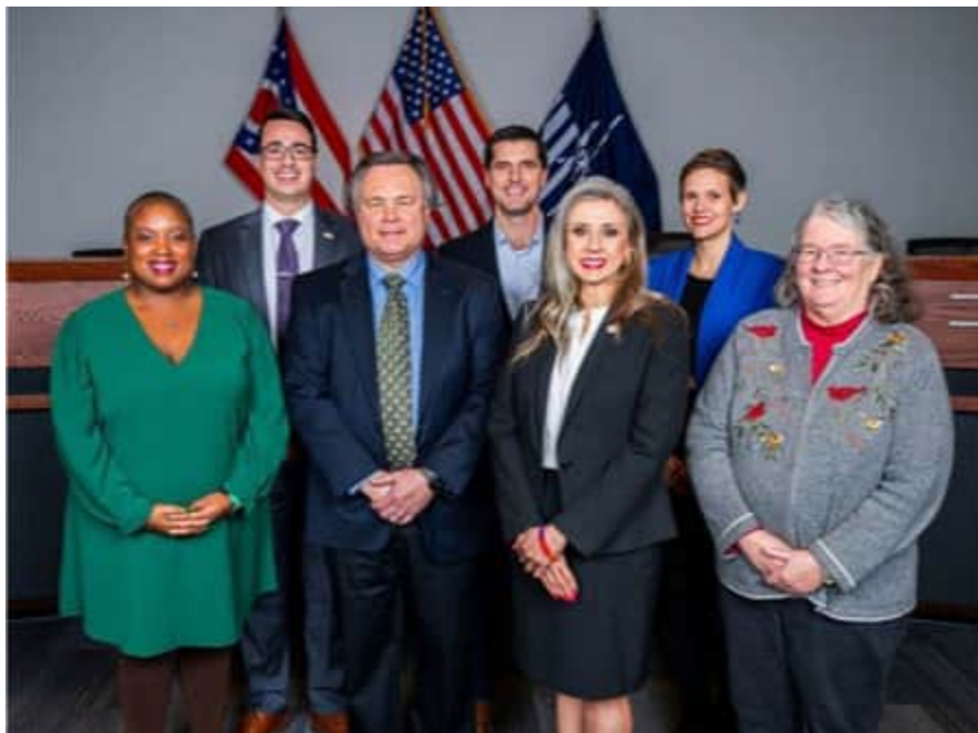
Gahanna City Council