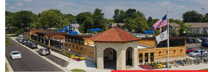
City of Grandview Heights Community Pool