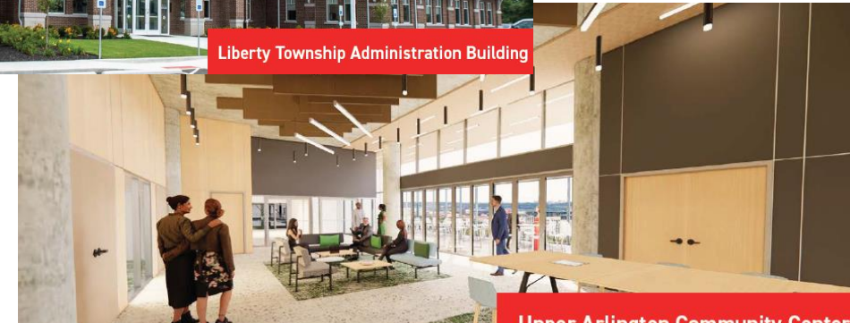
Upper Arlington Community Center