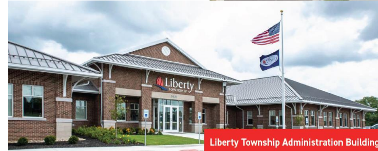
Liberty Township Administration Building