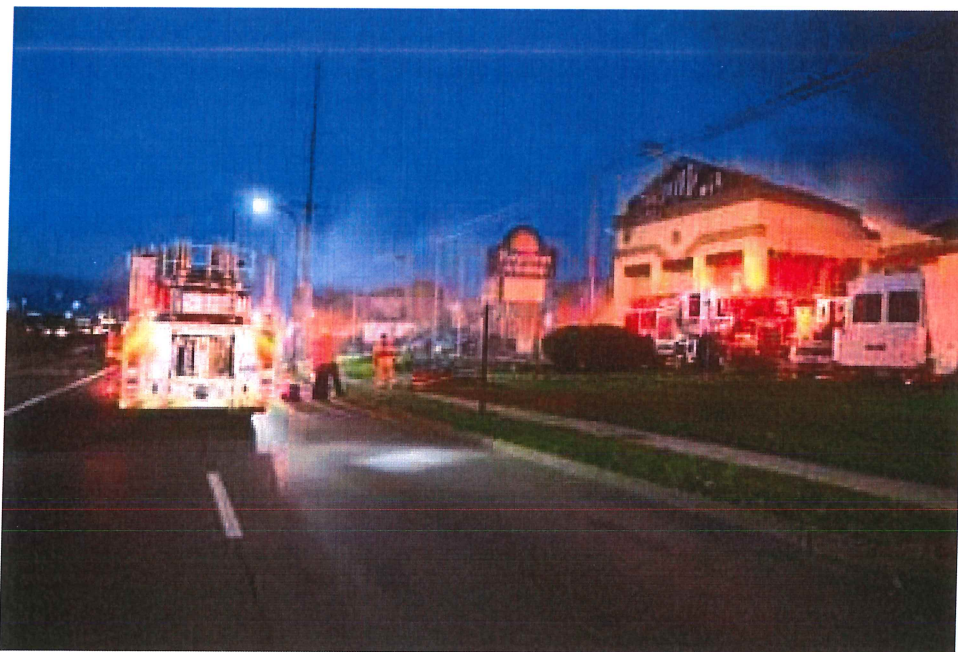
Third Alarm Fire in Hotel in Reynoldsburg on August 9, 2018.