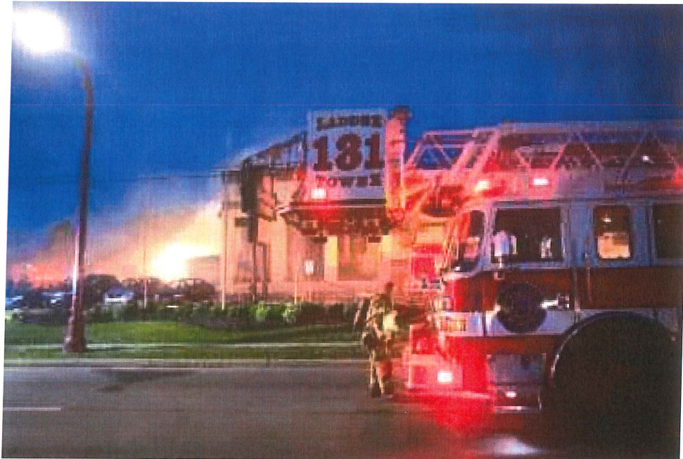
Third Alarm Fire in Hotel Reynoldsburg on August 9, 2018