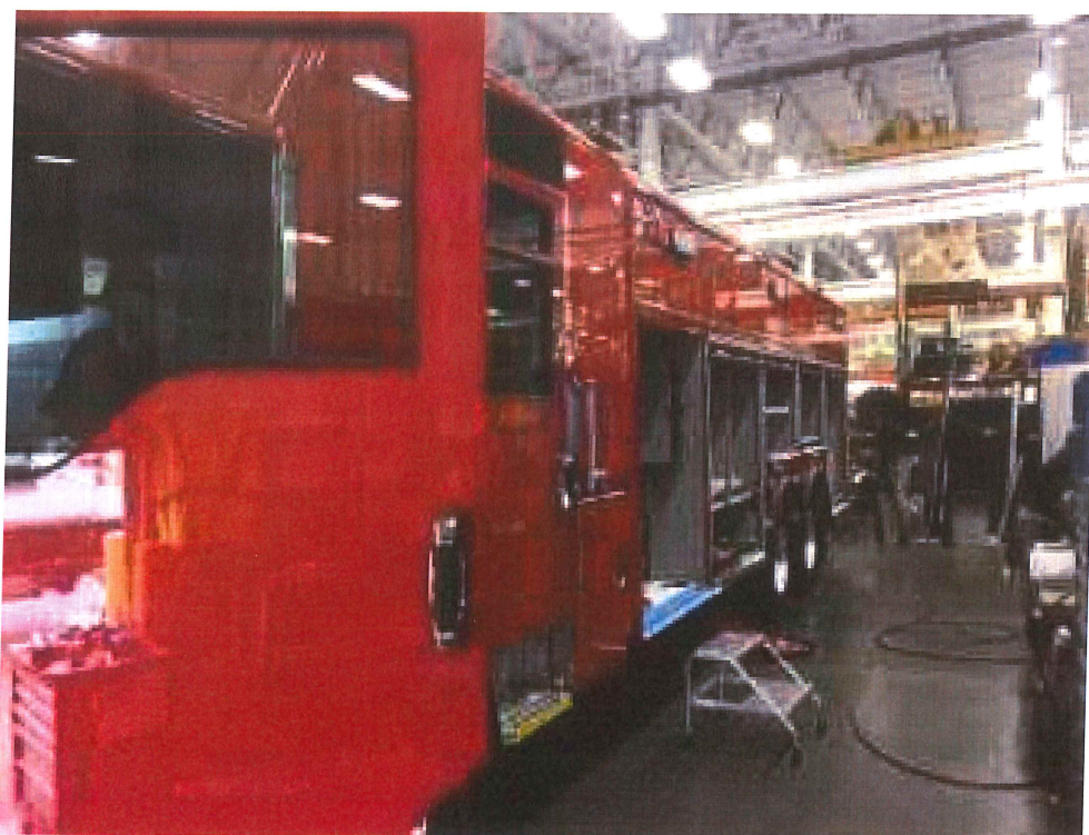
The Fire Division has two apparatus under construction at the Pierce Fire Apparatus manufacturing plant in Wisconsin. The Rescue is due to be delivered in late September, 2018.