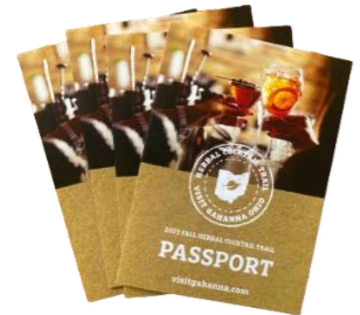
Herbal Cocktail Trail