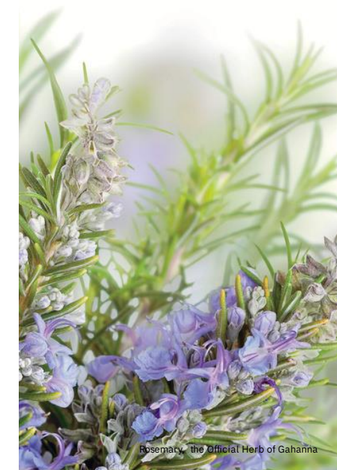
Herb Capital Experience Brochure

WELCOME TO GAHANNA, OHIO The Herb Capital Experience Explore Gahanna, the "Herb Capital of Ohio" and Immerse Yourself in the World of Herbs and Plants