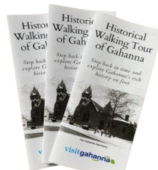
Historical Walking Tour Brochure

WELCOME TO GAHANNA, OHIO The Herb Capital Experience Explore Gahanna, the "Herb Capital of Ohio" and Immerse Yourself in the World of Herbs and Plants