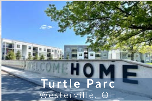
Turtle Parc Westerville, OH

As one of central Ohio's leading builders and developers of luxury homes, condominiums, office spaces, and mixed-use developments, The Stonehenge Company recognizes what it takes to create, sustain, and elevate a space into a community and a home. Since our founding in 1987, our mission has been to build and develop attractive, sophisticated, luxury residential and commercial environments that meet the needs and desires of home and business owners, municipalities, and our neighbors. At The Stonehenge Company we are committed to more than just laying the simple brick and mortar of the buildings that compose the communities in which we work. Instead, we strive to capture and reflect the unique elements that define them, elevate them, and help them grow and flourish.