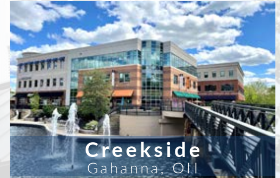
Creekside Gahanna, OH

We take pride in our ability to efficiently and cost effectively deliver high-quality products, with an unsurpassed attention to detail. We hold ourselves and our vendors to the highest standards, and this high standard translates into our projects, which we not only build, but also manage and maintain from the very first brick being laid, to every resident or client that walks through our doors and call our properties home, all from our offices located right in the heart of Gahanna.