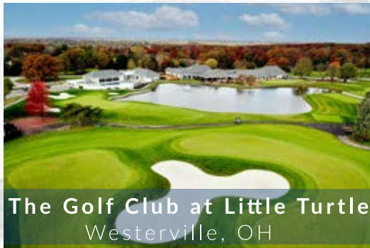
The Golf Club at Little Turtle Westerville, OH