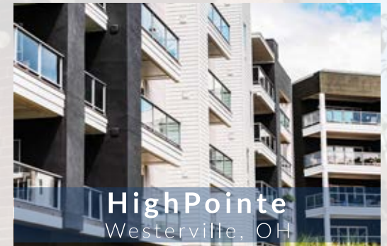
HighPointe Westerville, OH