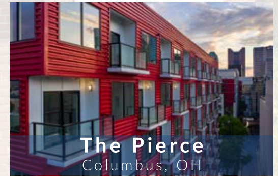
The Pierce Columbus, OH