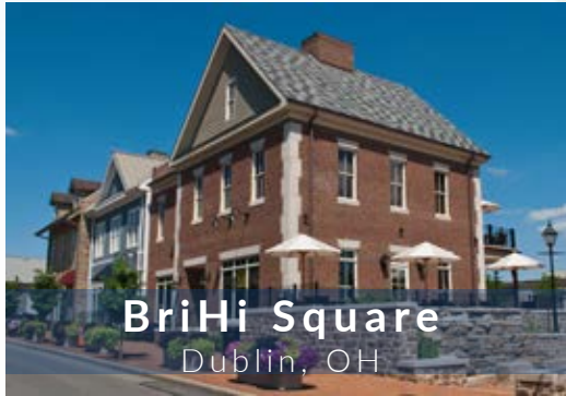
BriHi Square Dublin, OH