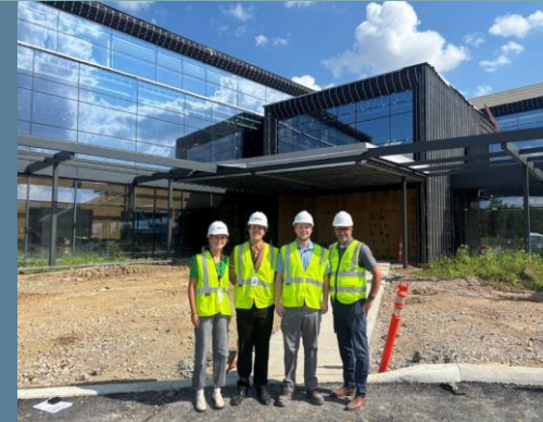
New City Building Tour