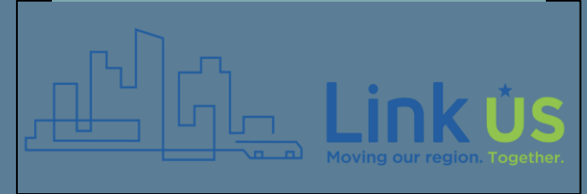
LinkUs Council Update Meeting