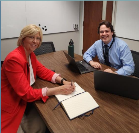
Meeting with the Mayor