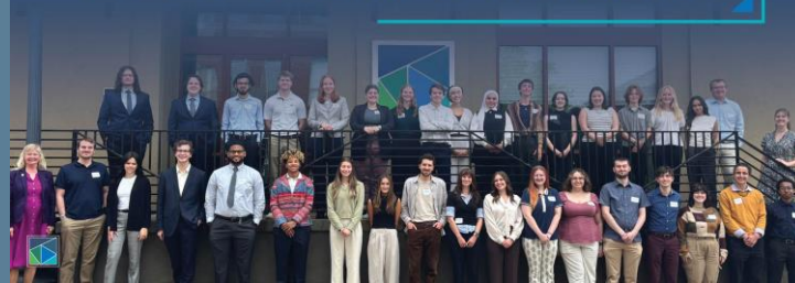
2025 MORPC INTERNS