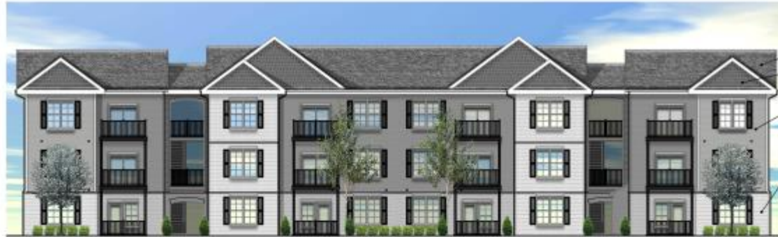
① BUILDING 'A' - FRONT ELEVATION SCALE: 1" = 10'

ASPALT SHINGLES VINYL SHAKE SIDING VINYL SIDING WHITE PAINTED BRICK