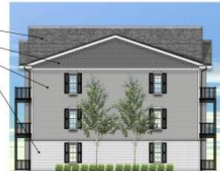
④ BUILDING 'B' - SIDE ELEVATION SCALE: 1" = 10'

ASPALT SHINGLES VINYL SHAKE SIDING VINYL SIDING WHITE PAINTED BRICK