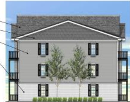
② BUILDING 'A' - SIDE ELEVATION SCALE: 1" = 10'

ASPALT SHINGLES VINYL SHAKE SIDING VINYL SIDING WHITE PAINTED BRICK